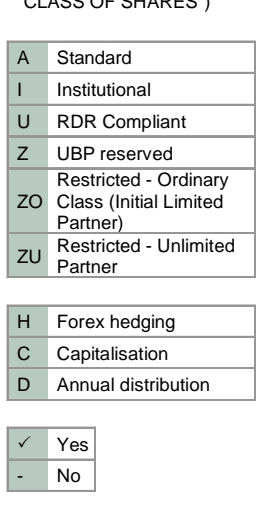
CAPTION (extract from "CLASS OF SHARES")